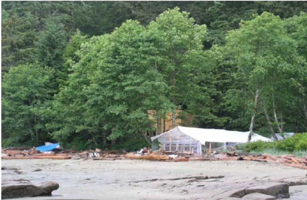
Chez Monique's

Chez Monique occupies a unique place on the West Coast Trail. It is located about half way on the trail in terms of time and distance. In addition, the trail runs right in front of the tarp and log café which means that all hikers must pass it as they go by. There is a designated campsite on Carmanah Beach, about a kilometer from the cafe. The owner/operator, Monique, has been in business for approximately 13 years, growing from a small stand selling pancakes to an operation that offers a varied menu.